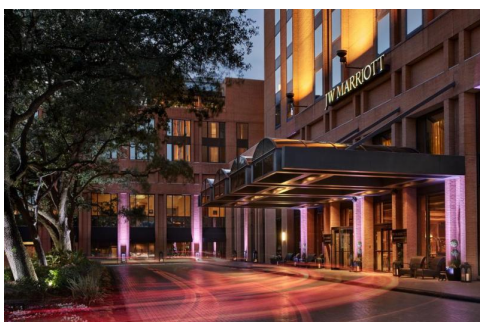
JW Marriott Galleria

She is a psychotherapist and the Founder/Executive Director of The Center for Connection and The Play Strong Institute in Pasadena, California, where she offers parenting consultations and provides therapy to children and adolescents.