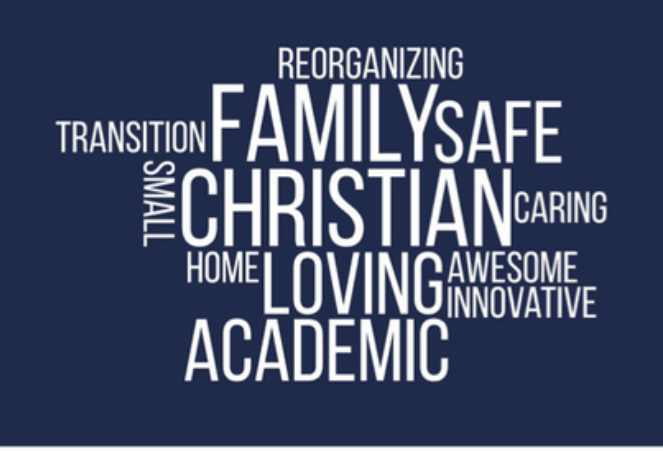
Top Five Words to Describe Trinity Episcopal School