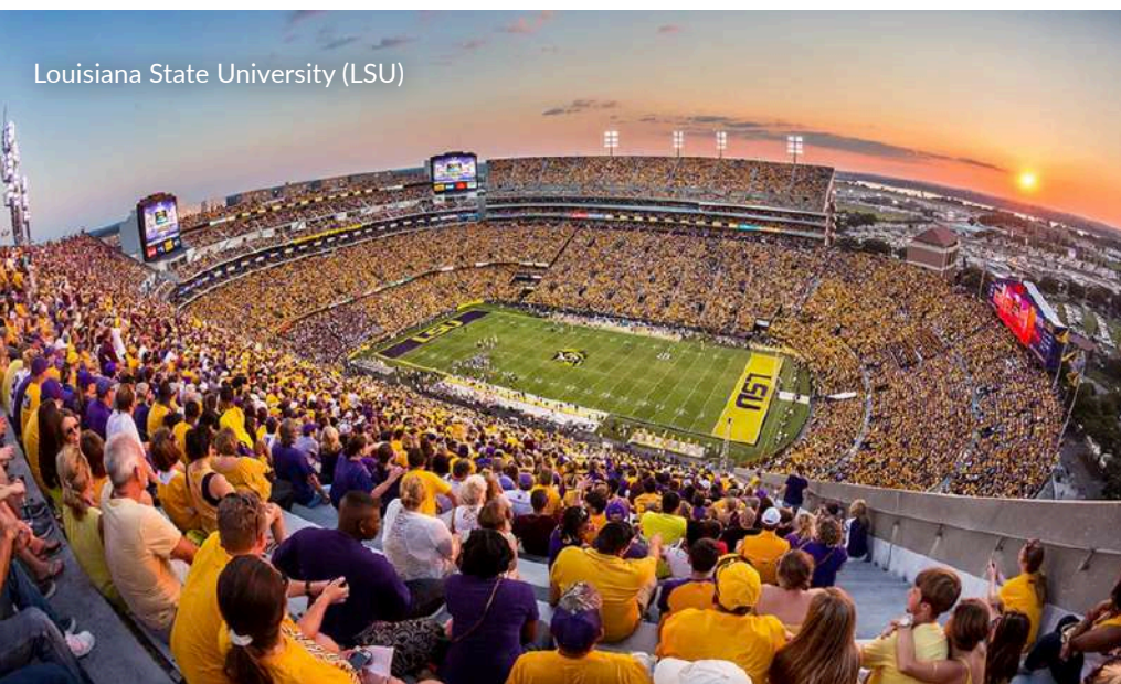
Louisiana State University (LSU)