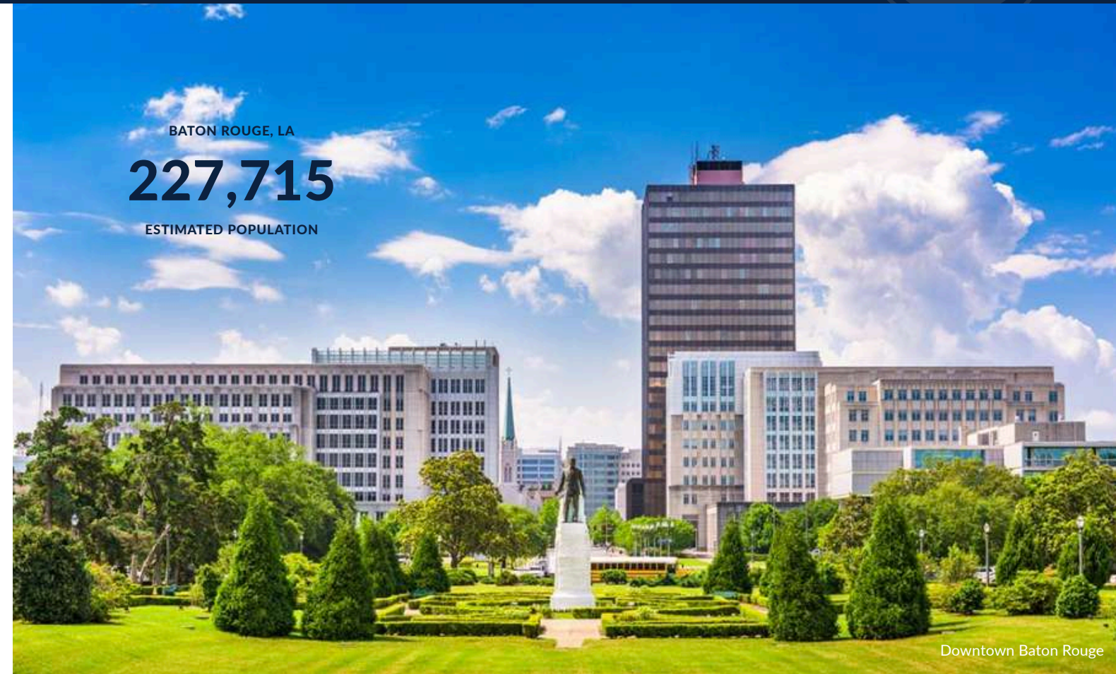
Downtown Baton Rouge

Baton Rouge is a major industrial, petrochemical, medical, research, motion picture, and growing technology center of the American South. It is the location of Louisiana State University, the LSU System's flagship university and the largest institution of higher education in the state. It is also the location of Southern University, the flagship institution of the Southern University System, the only historically black college system in the nation. The Port of Greater Baton Rouge is the 10 th -largest in the United States in terms of tonnage shipped, and is the farthest upstream Mississippi River port capable of handling Panamax ships.