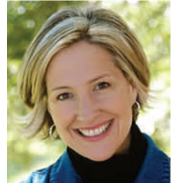
Brené Brown, Ph.D. Writer, Researcher, Educator University of Houston

Authentic Leadership: Guideposts for Cultivating Inspiration, Creating Meaning, and Fostering Accountability - Today's school communities are packed with exhausted and anxious parents and teachers trying their best to nurture overscheduled and anxious children. At the same time, families and faculty are desperately searching for ways to feel inspired, find meaning in their lives and work, and develop systems of accountability. These competing realities put leaders in a very difficult position when it comes to finding balance and perspective for their school communities. In this lecture, we'll explore three guideposts of authentic leadership and how leaders can use these to create connected and compassionate schools.